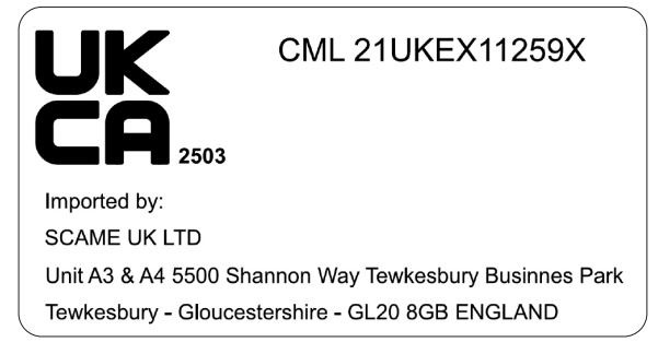
Figure 1- Example of marking Label