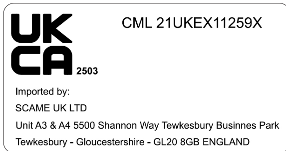
Figure 1- Example of marking Label